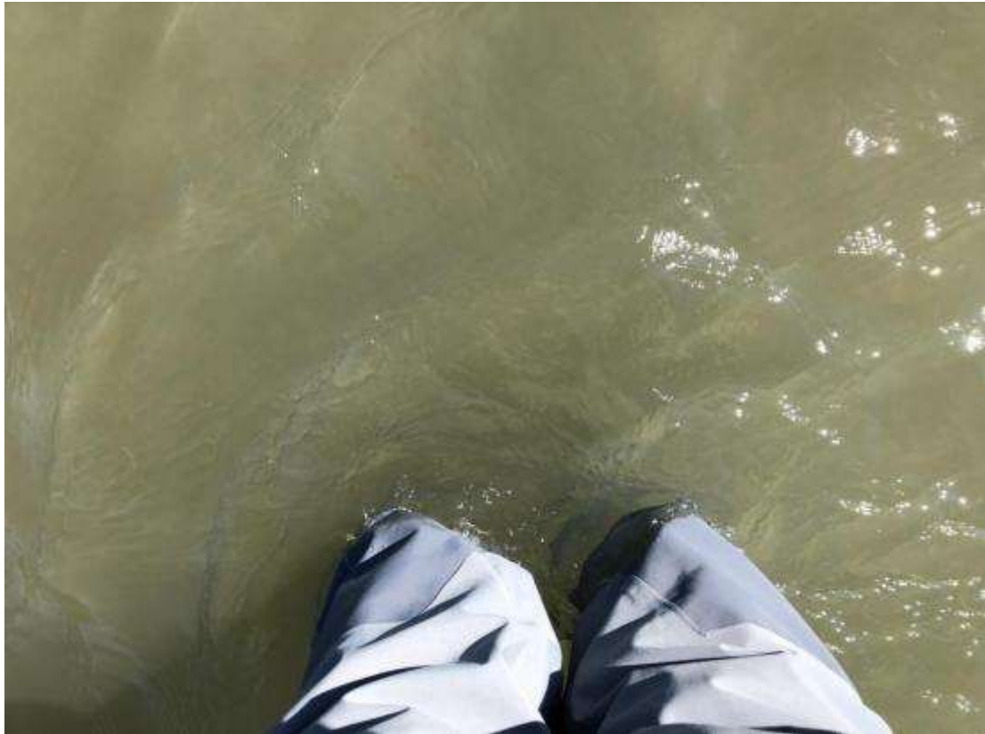
The water colour during the last days in the lower Gaula. Unfortunately it is still too murky to fish successfully with the fly.

There is also some news for tourists entering Norway: The Norwegian government has decided that from June 15, tourists from Denmark and Finland will be allowed to come to Norway. Only tourists coming from the island of Gotland are allowed to enter from Sweden. At the moment it looks like as July 20 could be the earliest date on which more detailed information may be available on whether and when tourists from Germany and other EU countries are allowed to travel to Norway. We hope that more information will come from the Norwegian government in 14 days.