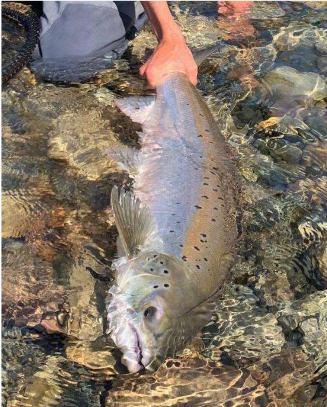
Another fresh salmon from Beat BS2.

Cato Holmengen also landed a nice salmon on Beat BS2. His fish was 72 cm long and weighed approx. 3.5 kg/ 7 \frac{3}{4} lb. Mortan A. Carlsen was also successful on Beat BS1 and landed a fresh salmon of approx. 4 kg /almost 9 lb. Mortan released his fish carefully.