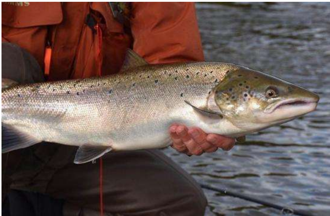
Sven Oliver with his salmon of approx. 4 kg (8,8 lb) from Beat E2.

Sven Oliver Spethmann also landed a nice salmon of 75 cm and approx. 4 kg (8,8 lb) on Beat E2. His fish was still pretty silver. Sven Oliver released his salmon carefully after taking a few pictures.