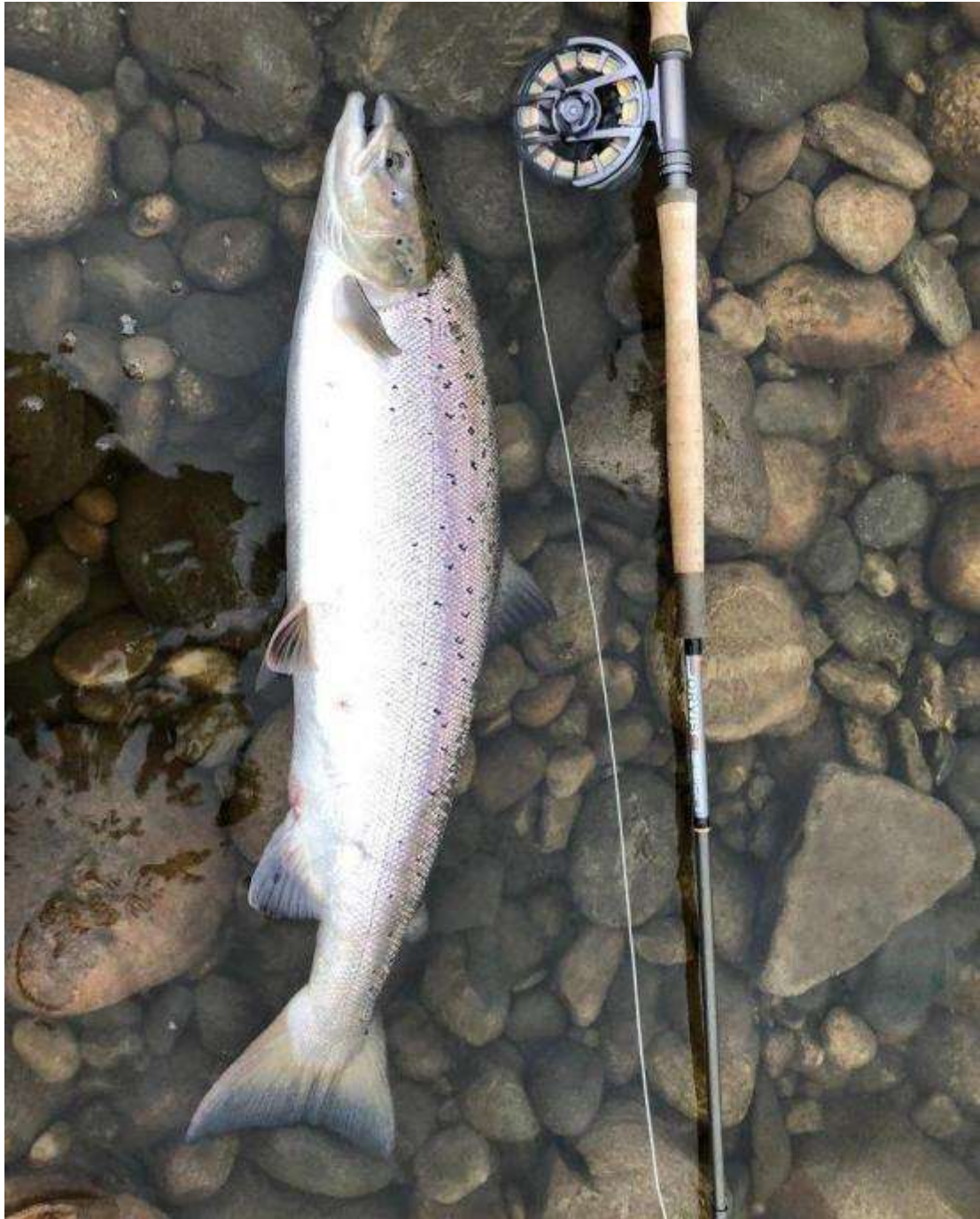
A beautiful salmon of 83 cm and approx. 5,5 kg (12,1 lb), which Thies landed on Beat A2.

Manfred Raguse also caught two more fish on Beat C2. First he landed a salmon of 66 cm and 2.8 kg (6,1 lb) and a short time later a second salmon of 89 cm and approx. 7.0 kg (15 ½ lb). Manfred carefully put back both fish.