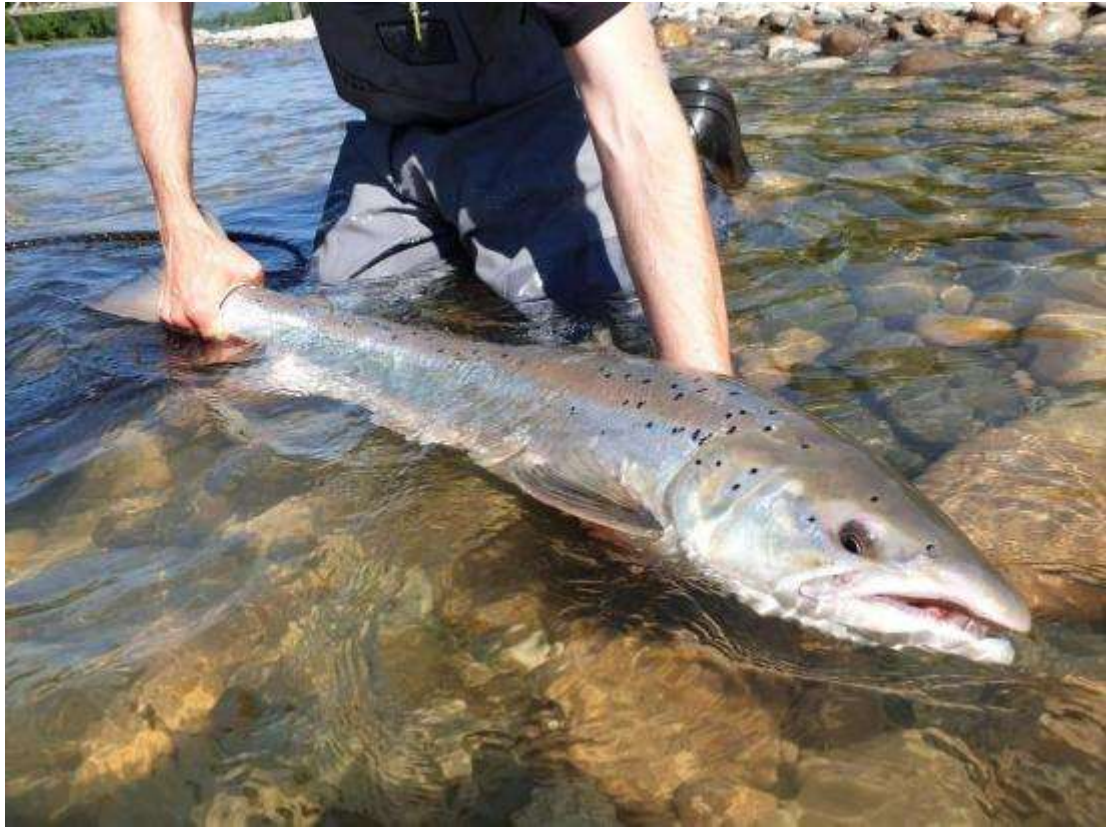
Another beautiful fish from Beat L1.

The water temperature has now risen significantly to over 10 ° C and we saw the first fish on the surface. The next few days will be unusually warm with temperatures of up to 30 degrees. This will make the river rise again a bit, but it looks like a lot of the snow has already melted. As soon as the temperatures will drop again, as expected from next Monday, the water level should drop significantly. Hopefully, this will result in the water in Kval clearing up again and that the fish can pass the Gaulfossen in the near future.