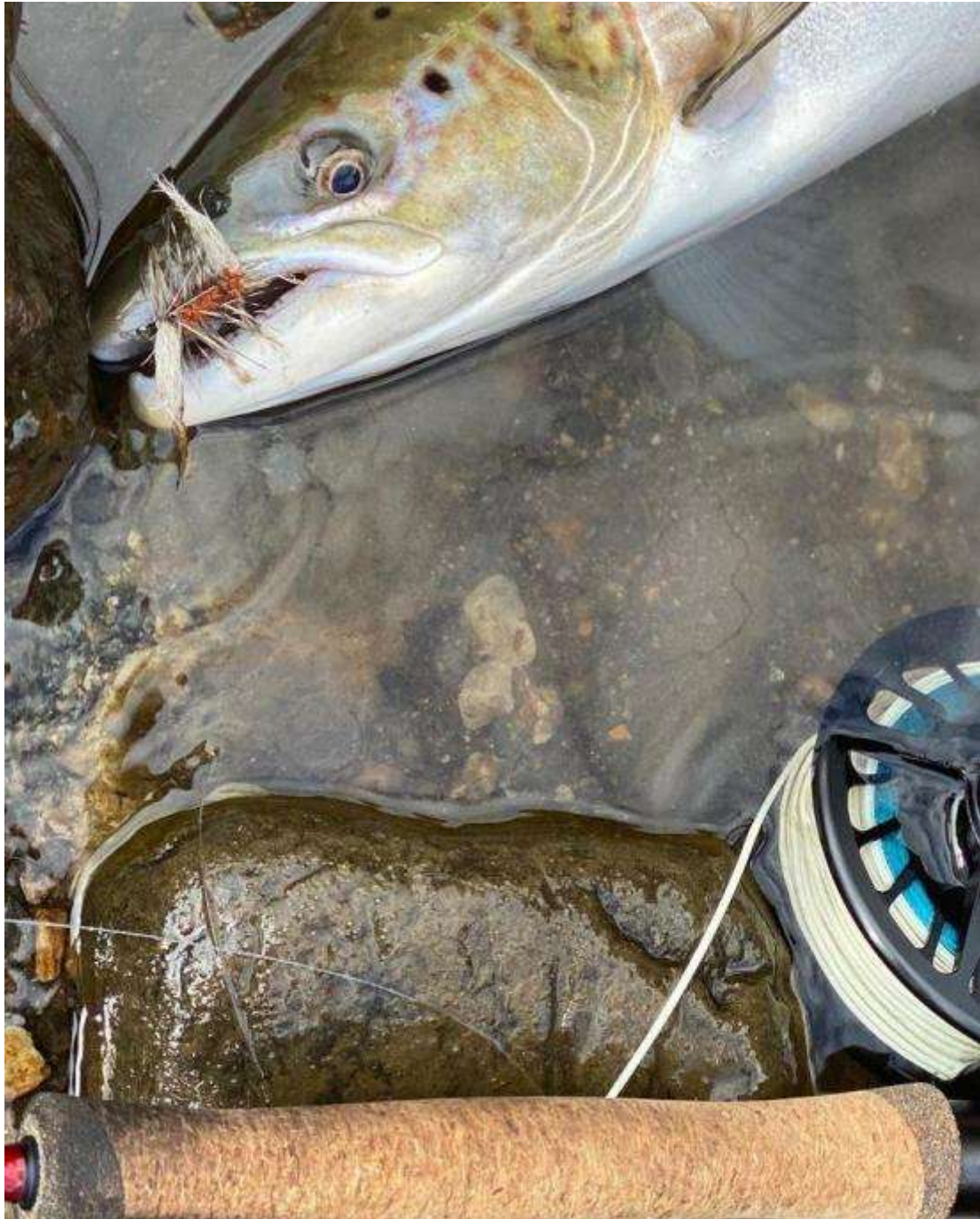
A Grilse took Henriks dry fly in one of the many smaller pockets in the Bua river.

As these catches show, despite difficult conditions, August can be quite successful on the Gaula. You can book a week of fishing in August in the exclusive rotation Beats from € 1.240 through the International Flyfishers Club!