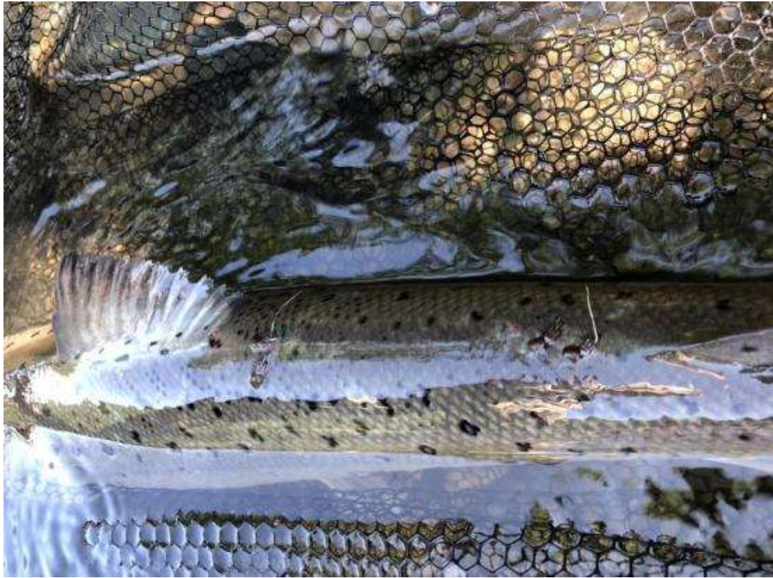
An Atlantic salmon as fresh as they can be, with long tail sea lice.