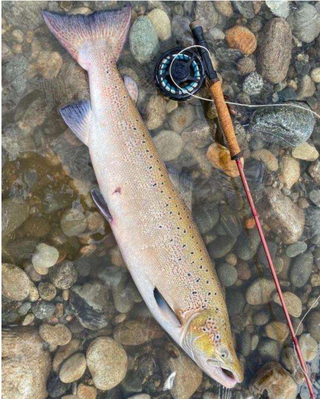
A very nice fish of 100 cm that Henrik was able to land with a single-handed rod and a dry fly on Beat C2.

Peter Gran also caught a nice salmon of 82 cm and approx. 5.5 kg (12,1 lb) on Beat C2. This fish also took a fly from the surface, but this time it was a Riffing Hitch, not a dry fly.