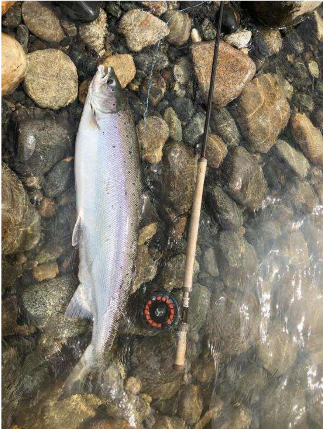
Thies caught this beautiful salmon of 103 cm on Beat B2.

This fish is another sign that the Beat B2 developed significantly positively due to the long and powerful flood in May / June 2020. In the Beat B2 (Renna) some Grilse and medium-sized salmon have been caught in the last few days.